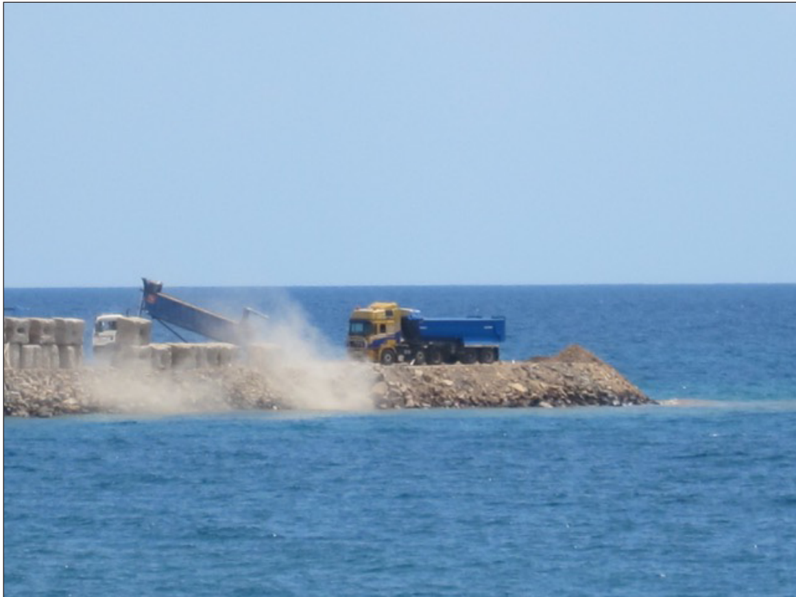
Figure 3: Construction of the new port in Granadilla, Tenerife, 2011.