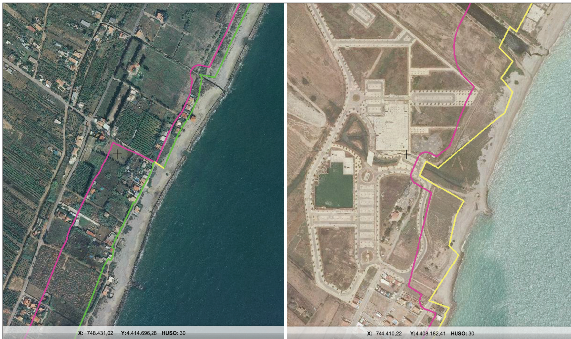
Figure 1: Images from the Ministry of Agriculture, Food, and Environment online platform to visualise the Demarcation of the Shoreline. In pink, the end of building land; in green, the end of the sea; in yellow, demarcation still under litigation. The buffer zone in between both lines is the ambiguous zone that operates as an easement of protection. On the left image, the disparate definition of the coast between two boroughs is exposed by the mismatch between lines. On the right image, the lines are twisted to adapt to a new development. http://sig.magrama.es/dpmt/ Accessed February 2016.

The 1988 Spanish Law of the Coast and its subsequent reforms have instrumentalized scientific reports justifying the demarcation of the shoreline through factishes . Following Bruno Latour and Isabelle Stengers' concept, the factish is a form of hybrid knowledge between the factual and the fetish (Latour 1991; Stengers 2010). Microscopic grains of sea salt have been used in court to prove, or dismantle, the material history of the millenary geology of the beach. In the case of Las Teresitas Beach, Tenerife, salt was literally taken to court, in order to prove where the highest tide in history would define the end of building land. The image of the soil samples, with their content or non-content of sea salt and fossil sea creatures, was intended to prove whether the sample site belonged to the land or the sea, as stated in the DL-210-TF report, produced by public company Tragsatec in 2008 (Fig. 2). However, it carefully concluded that even if the appearance of fossils and marine shells in the area of the beach would prove that the particular spot belongs to the sea, their presence is not natural, as they have not come to the surface due to natural tidal movements, but the samples ended up in that spot due to excavation of terrain to build the adjacent road. Hence, the role of the soil samples in proving the presence of sea salt was immediately undermined by the possibility of human-