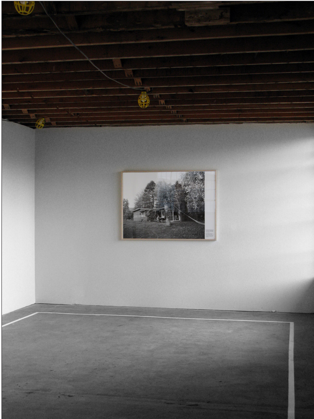
Figure 5: When The Levees Broke We Bought Our House , Superflex, 2008. Credits: Hakan Topal.

economy, and the vulnerabilities of local communities and their exposure to catastrophic events. The association between a Danish family and the people of the Lower Ninth Ward provides a self-reflexive memo; opens a window into an art collective's own social-economic conditions as European/white petit-bourgeois and their significance as artists. By 'reading' the details of the photograph we get many clues about where the artists are coming from, how they live, what their environment looks like. Their critique is very poignant in the context of the Lower Ninth Ward; how the welfare of a family in Denmark is dependent on the suffering of people in New Orleans and while the global capitalist system is intimately connected, people's destiny is tied together through a speculative capitalist logic.