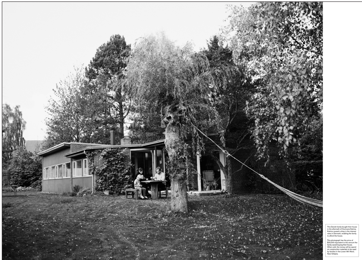
Figure 6: When The Levees Broke We Bought Our House , Superflex, 2008.