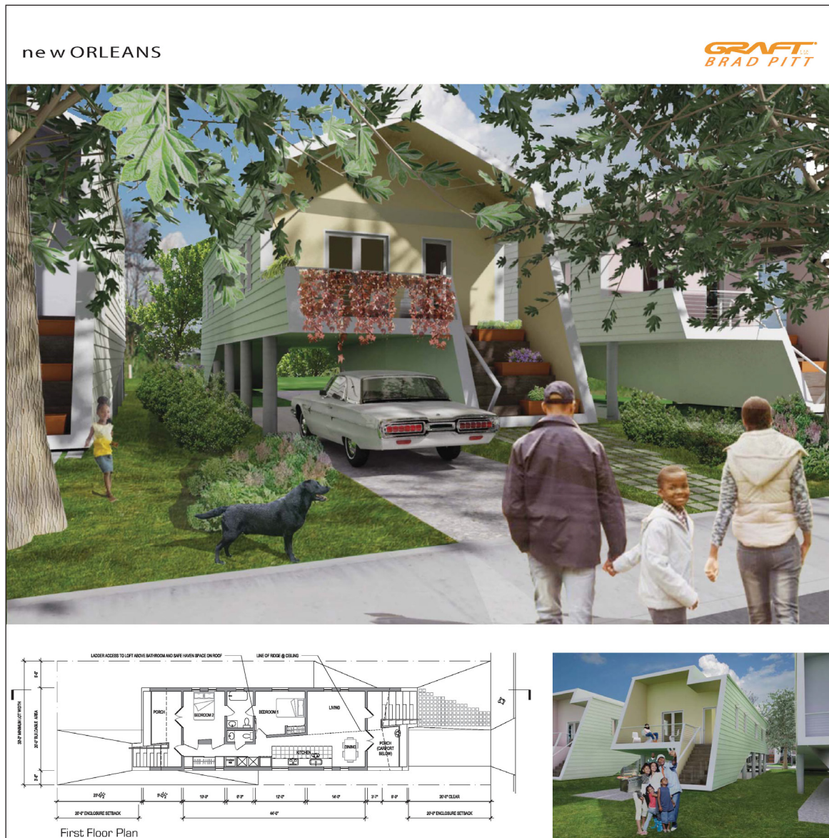
Figure 1: Design Submission by Graft with Brad Pitt (Make It Right, 2014).

These projects lacked a social vision and remain as missed opportunities to critically rethink the New Orleans Lower Ninth Ward and its troubled social history. A moralistic emphasis on the idea of community, fundamentality undermines the fact that the celebrated community itself is a byproduct of decades of racial segregation. My criticism is tied to the architect's rather adaptable responses to RFPs (Request for Proposals) which emphasized family, community, the private space, sustainability, ecology, and yet none of them destabilized the uneasy spatial-social relationships to compassionately rethink the idea of community in relationship to a new imagined community which can be healed through design processes.